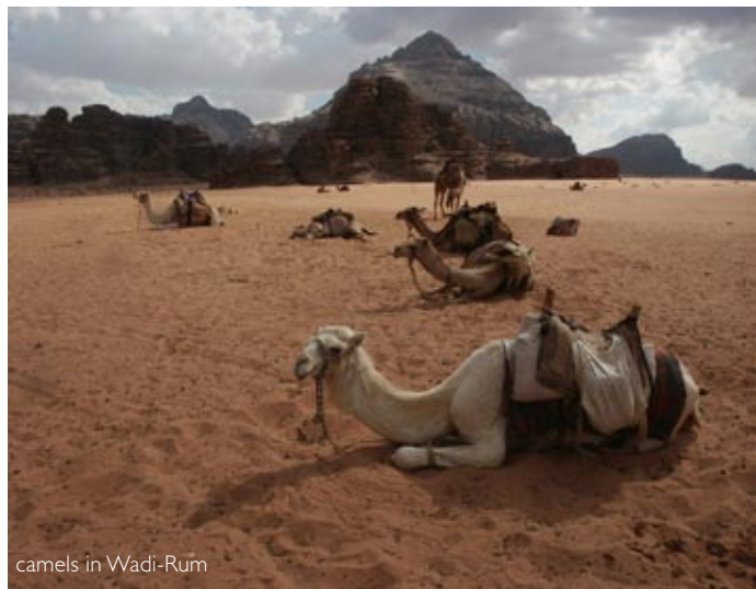
camels in Wadi-Rum

It’s hard to put into words the mystic of this Kingdom. It’s captivating and historic, filled with friendly people and delicious food. My evenings were spent dancing to Jordanian music and feasting on Middle Eastern cuisine. At the end of this journey, I was sad to leave but thankful to have experienced the magic and beauty which lies beneath the Jordan moon.