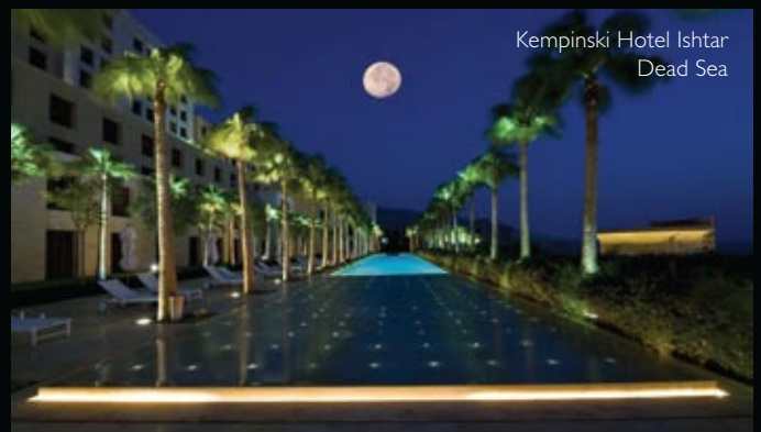
Kempinski Hotel Ishtar Dead Sea