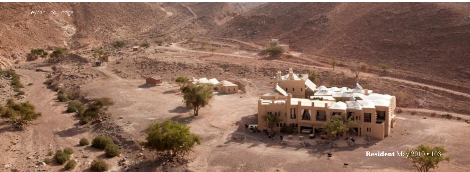
Feynan Eco Lodge